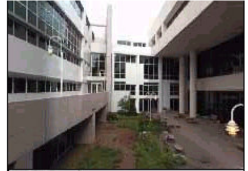
School of Law