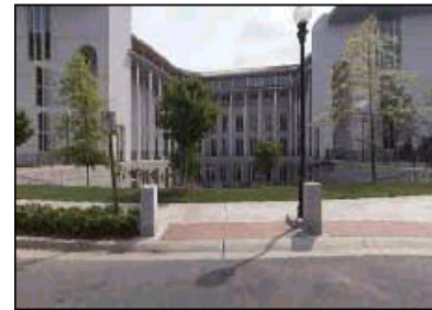
Goizueta Business School