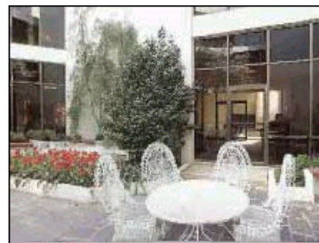
School of Nursing