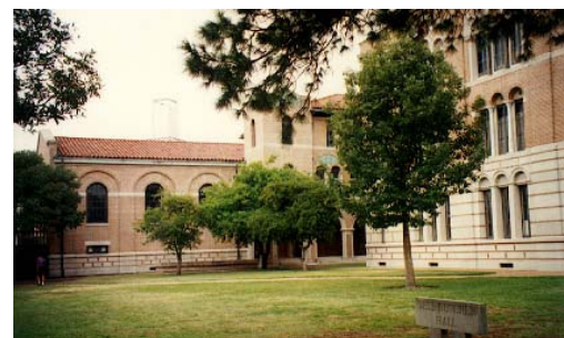
Howard Keck Hall