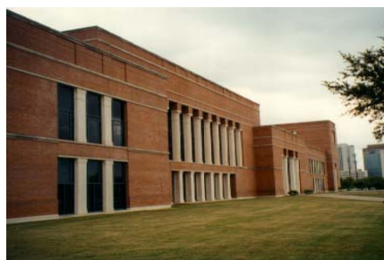
Shepherd School of Music