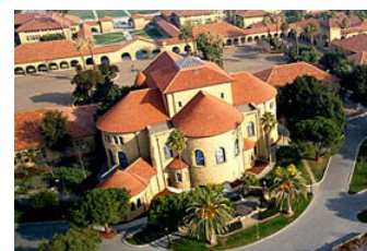
The Main Quad