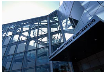
Science & Engineering Quad