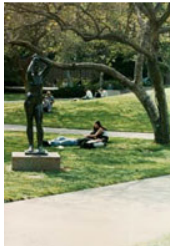
Franklin D. Murphy Sculpture Garden