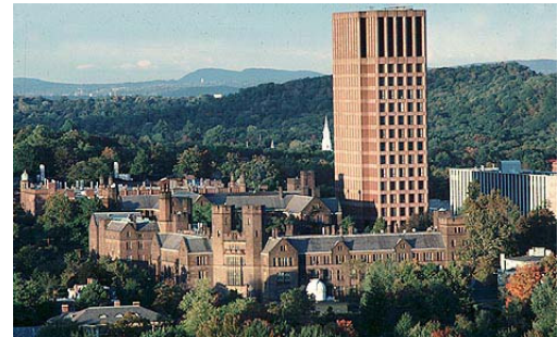
Kline Biology Tower