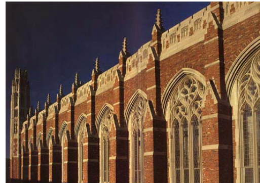
Yale Law School

Information and pictures provided by collegeboard.com & yale.edu.