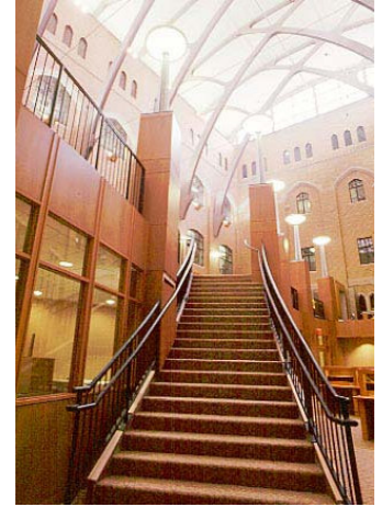
Gilmore Music Library